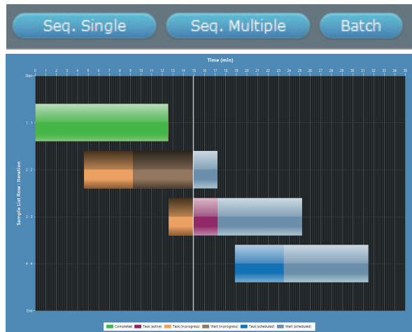
Figure 2 TRILUTION® LH Software Sample Run Type Options (Seq single, Seq Multiple, Batch) and Scheduler Display